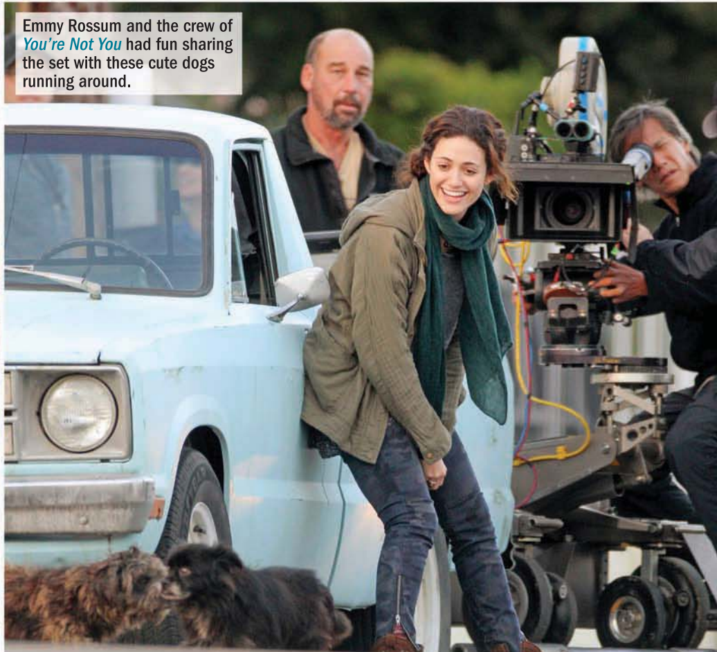
Emmy Rossum and the crew of You're Not You had fun sharing the set with these cute dogs running around.