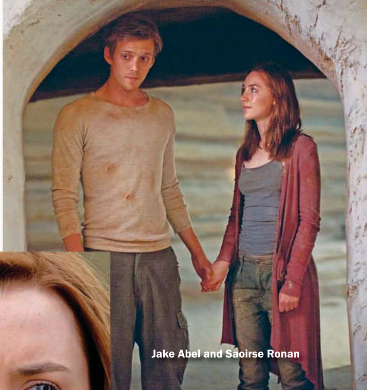
Jake Abel and Saoirse Ronan

I know, right? We were calling it a love square on set. Firstly, Max Irons was just lovely to work with. We got on really well and we actually knew each other before we