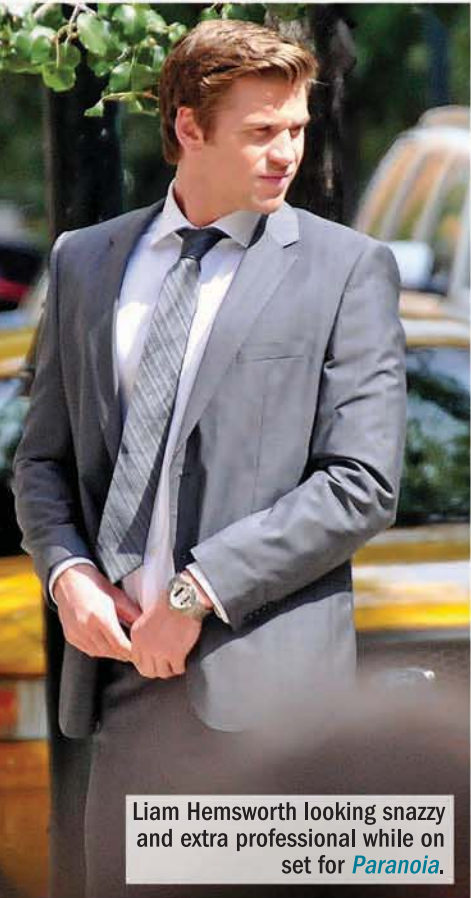
Liam Hemsworth looking snazzy and extra professional while on set for Paranoia .