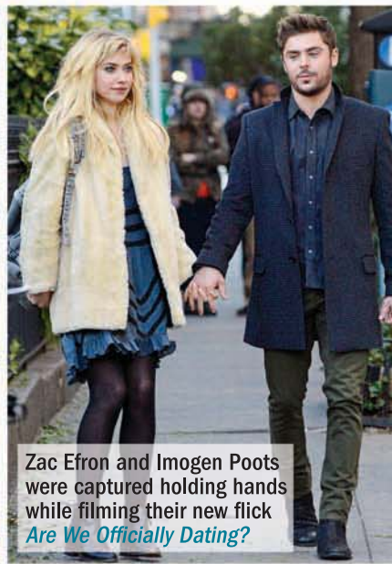
Zac Efron and Imogen Poots were captured holding hands while filming their new flick Are We Officially Dating?